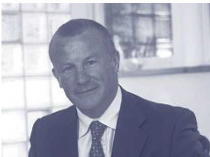
Fund Management: Neil Woodford